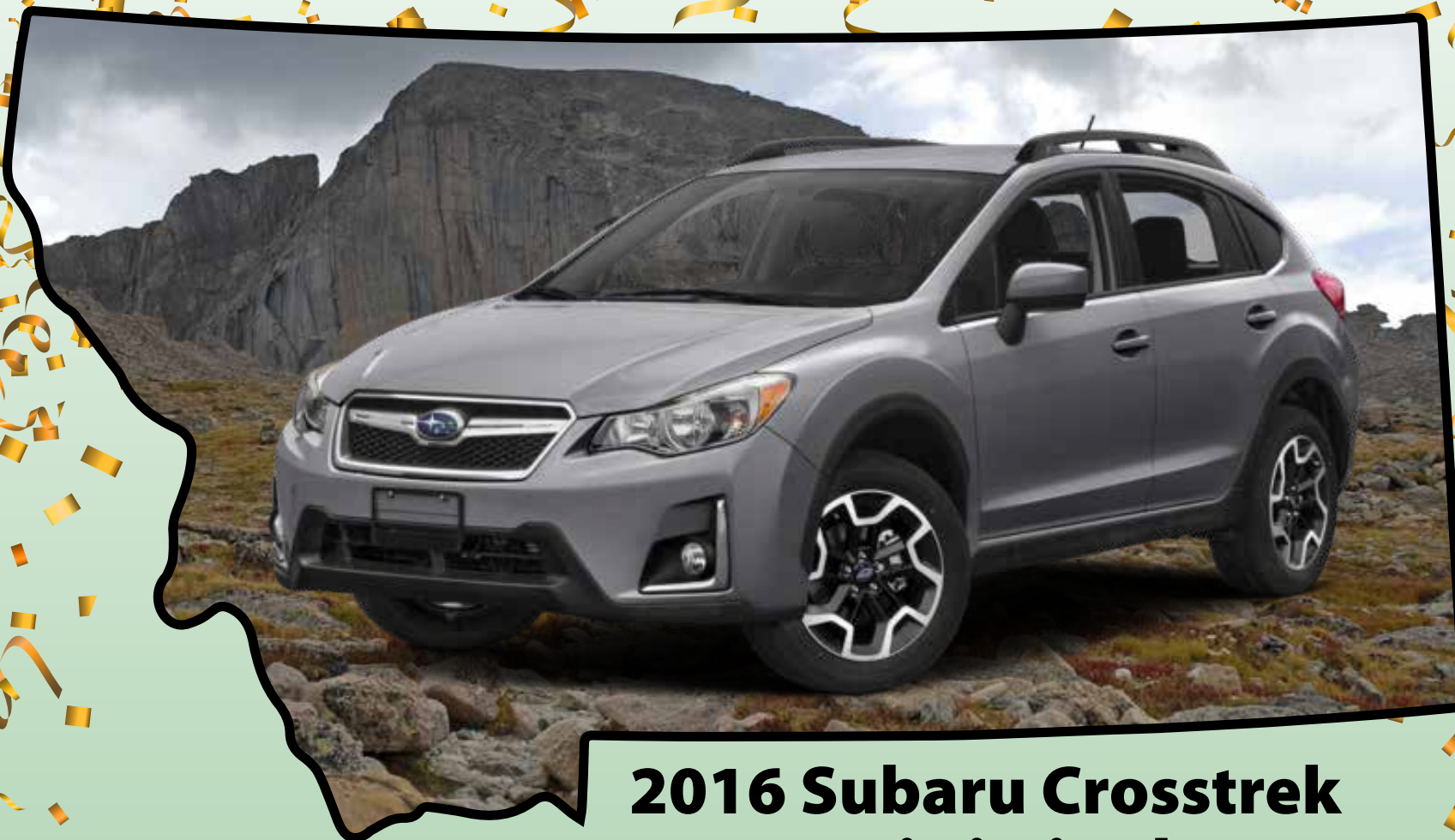
2016 Subaru Crosstrek 2.0i Limited